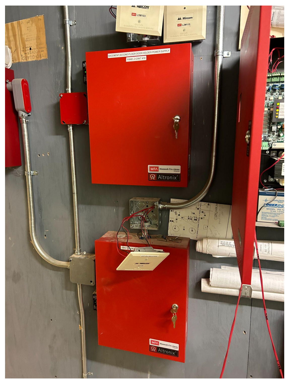
Continued Fire Alarm Subpanels