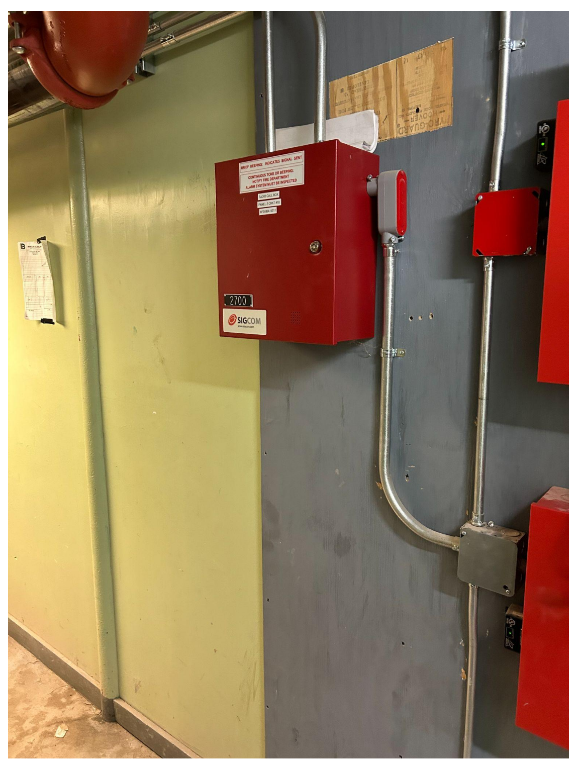
Last of the Fire Alarm subpanels.