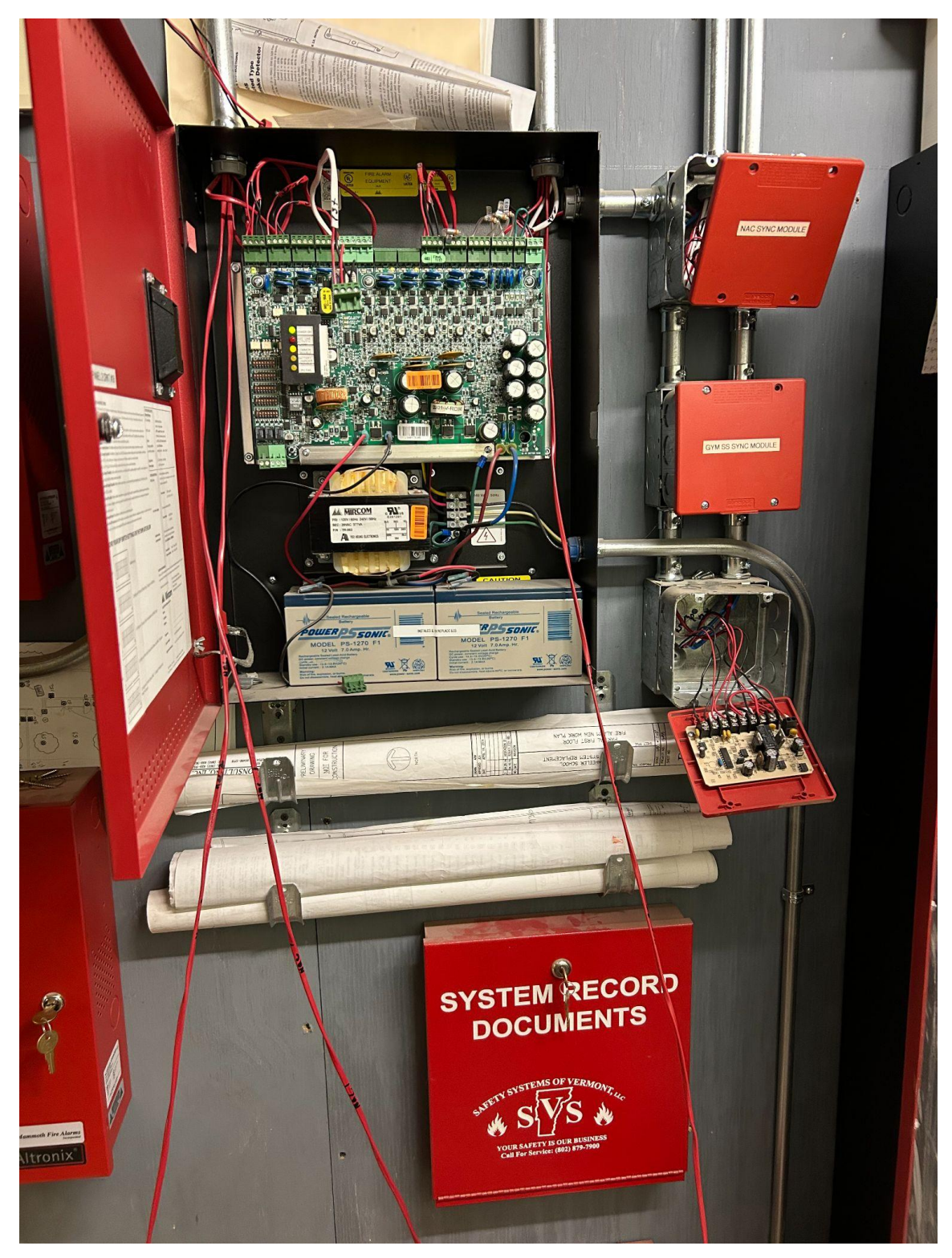
Fire Alarm subpanels